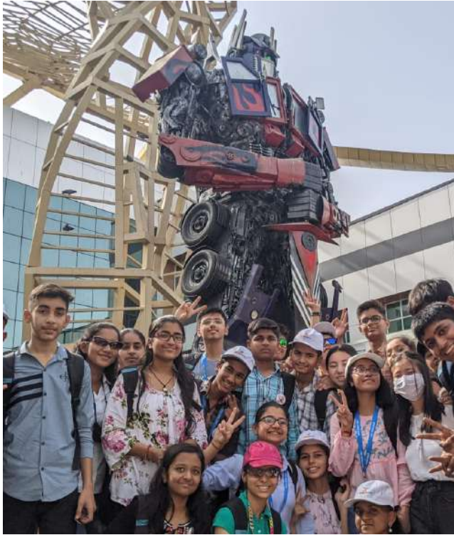
Here is one from the visit at vedshala

We also visited the science city in Ahmedabad, Gujarat as a part of our tour. We received badges there with certificates and had a lot of fun. We also visited their famous robot café there and it was epic. Here is a memorable click from there: