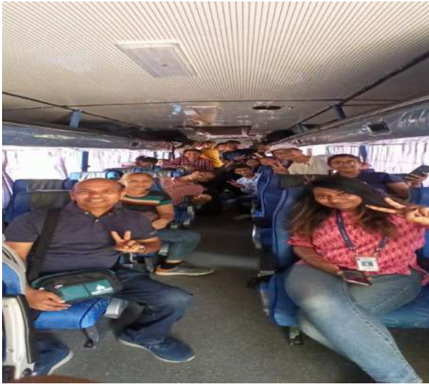
RETURNING FROM SHAR

THIS WAS THE END OF MY BEAUTIFUL YUVIKA JOURNEY, I AM THANKFUL TO EVERYONE WHO HAS CONTRIBUTED IN MAKING THIS JOURNEY SO EXQUISITE AND EVENTFUL, AS DUE TO THIS JOURNEY I AM NOW FOREVER CHANGED . JAI HIND.